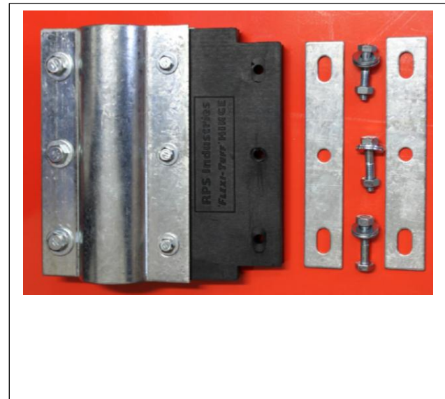
200mm Street Sign Package:- Everything required in a Single Pack